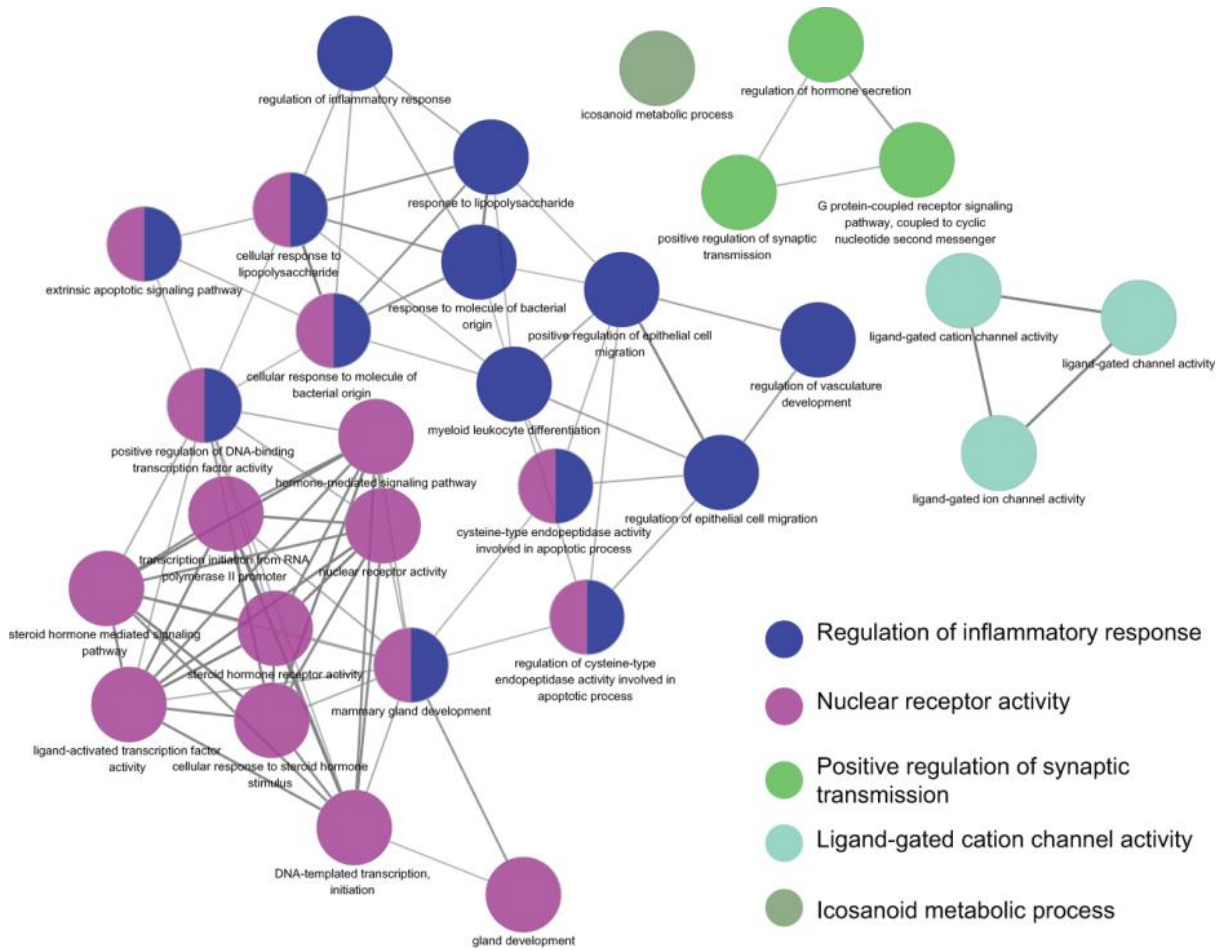
Supplementary Figure 1. The dots represent biological processes associated with potential targets, and the lines represent interrelationships between biological processes.